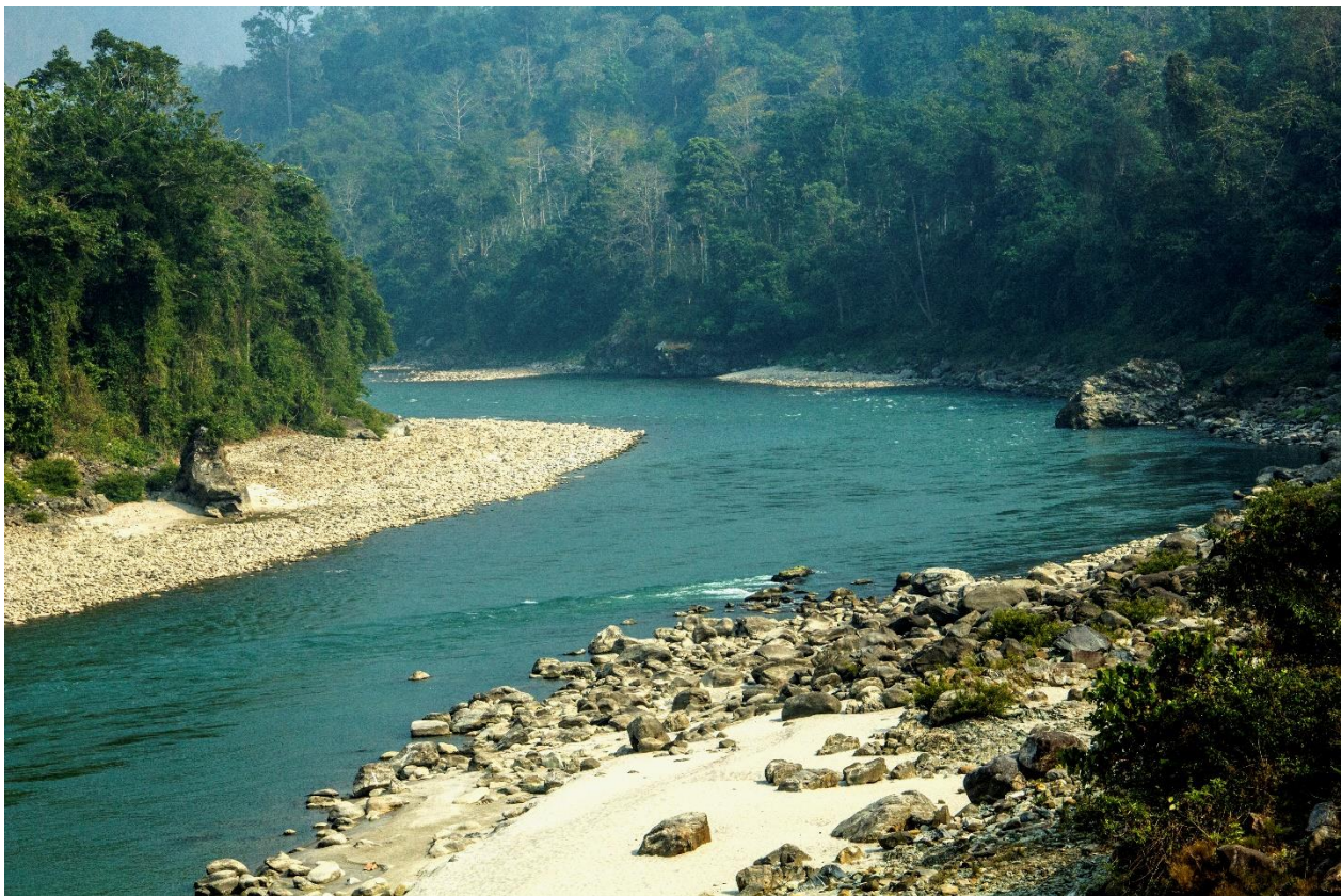
Manas river flowing from Bhutan through the Manas Reserve to merge into the mighty Brahmaputra

international border with Bhutan, well into the territory of which the thick forest cover extends. At stretches, the forest cover is so dense that even sunlight cannot penetrate it. Areas adjoining the river often get inundated during the rainy season erasing the roads and making pedestrian as well as vehicular movements impossible. Partly because of this, it became a safe haven for insurgents during the 1980s and 1990s, driving away the tourists who are now returning. The forest has a long history – parts of it were declared as reserve forests between 1907 and 1927 before the entire area was declared as a Sanctuary in 1928. The Sanctuary formed the core of the 283,700 hectares of Manas Tiger Reserve from April 1973 and entered the list of UNESCO World Heritage Sites in 1985, and was declared a National Park in 1990. Its wet grasslands are home to about 500 species of birds, 40 species of reptiles and 60 species of mammals, 22 of them endangered. Some of them are rare, such as the golden langur, found nowhere else in India, and the beautiful red panda.