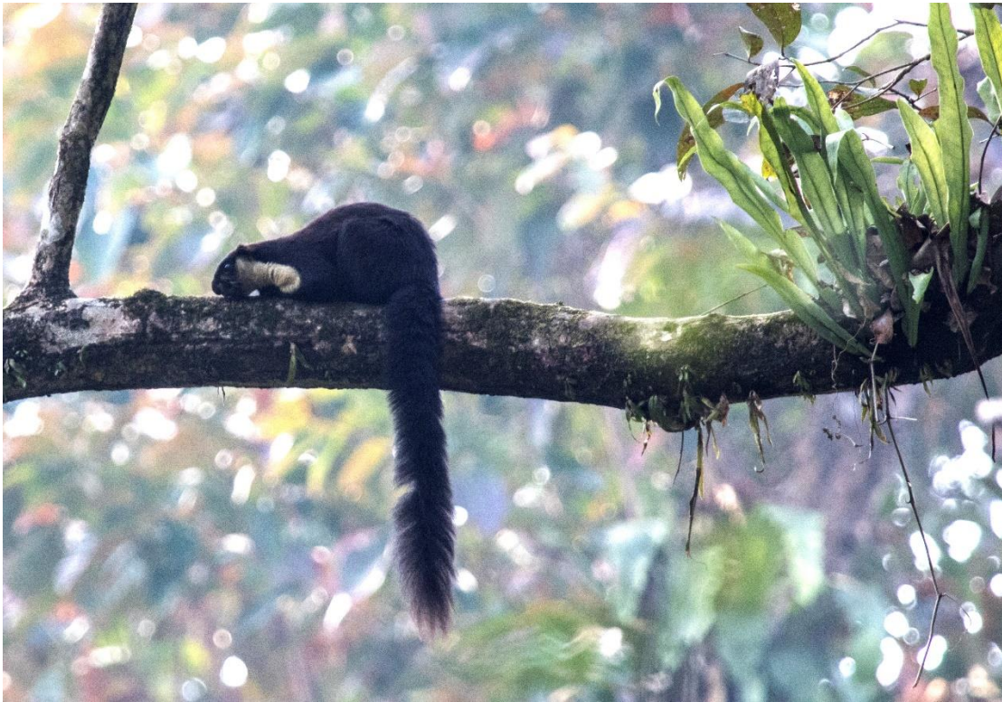
A Malayan giant squirrel resting on a tree