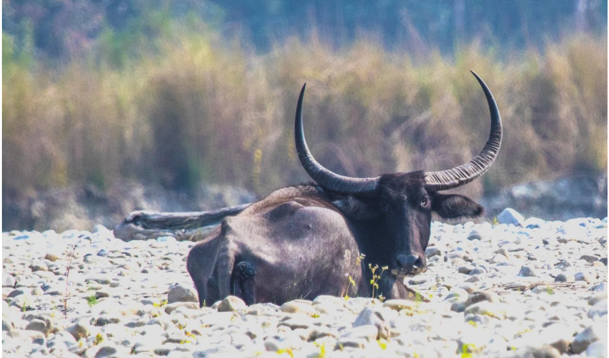
A wild bison taking a well-deserved rest