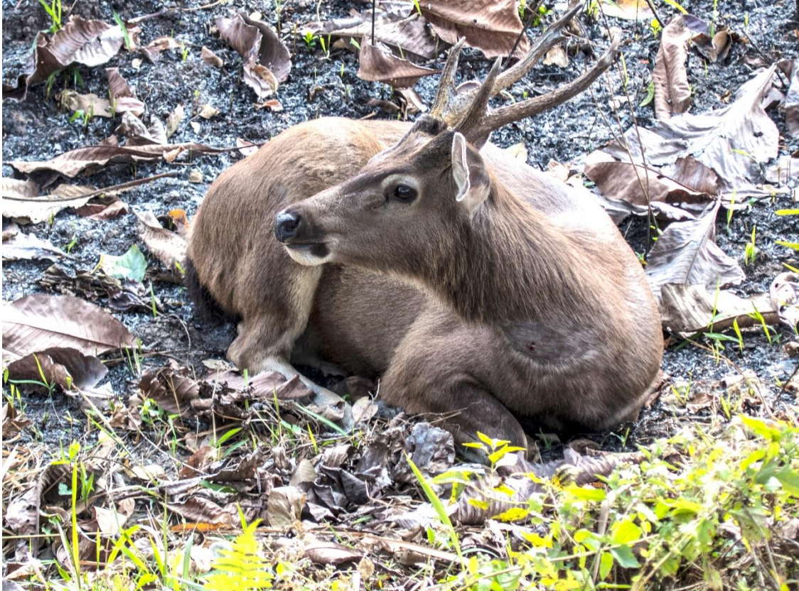
A sambar expecting its mate?