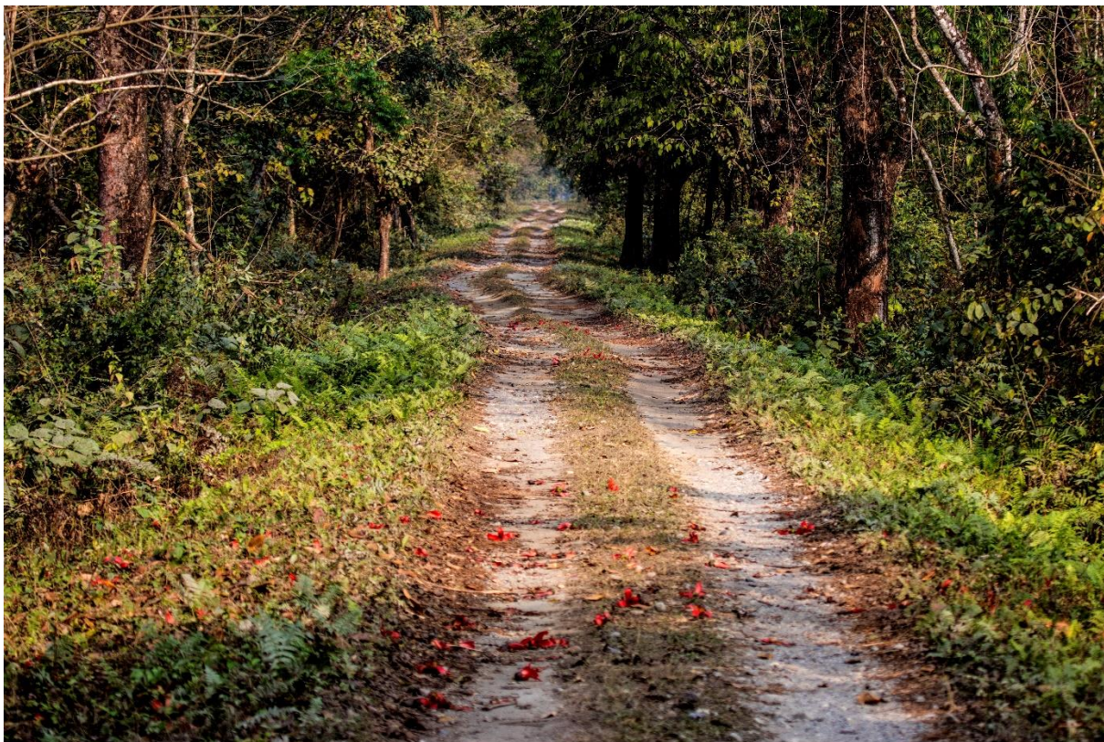
A driveway in the Manas Tiger Reserve in Assam

Before civilisation, there was only Nature and man was a part of Nature, struggling and toiling like all her children. There was no memory either, only fear and some primal desire. Then sorrow and happiness were born together. Then desire and fear, sorrow and happiness, all blended together and became memory, and memory separated man from nature. Memory became man and man became the mind – Manas.