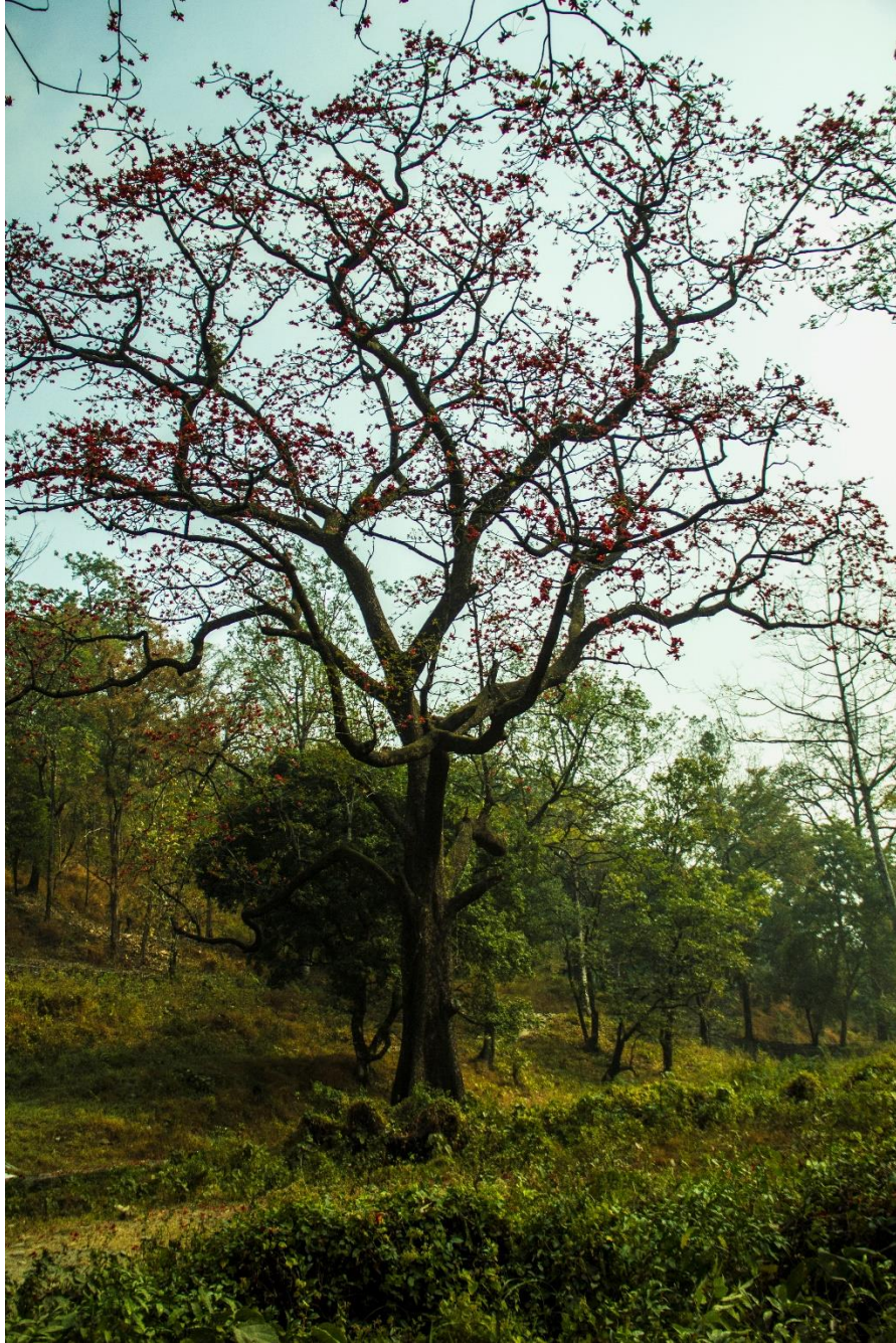
A Shimul tree is full blossom inside the forest of Manas

The few gems that we collect through life we put in the cells of the honeycomb of our memories; some lie deep within its layers; we dare not touch them lest they evaporate. We can only catch fleeting glimpses of their beauty. They are only to be looked at, and not for too long, otherwise you lose them forever. Some others are very fragile, they are to be treated very gently, or else they melt into tears. Alas, all these soon depart into the realm of dreams, not to be recalled at our will.