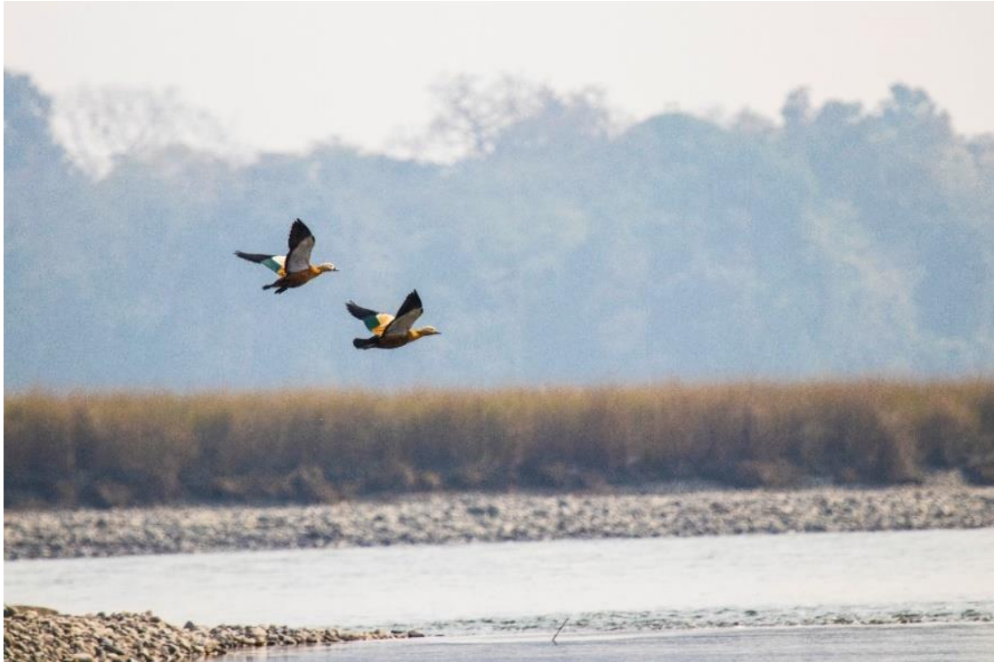
A pair of Brahmini ducks flying over the river Manas while the day is quietly dreaming