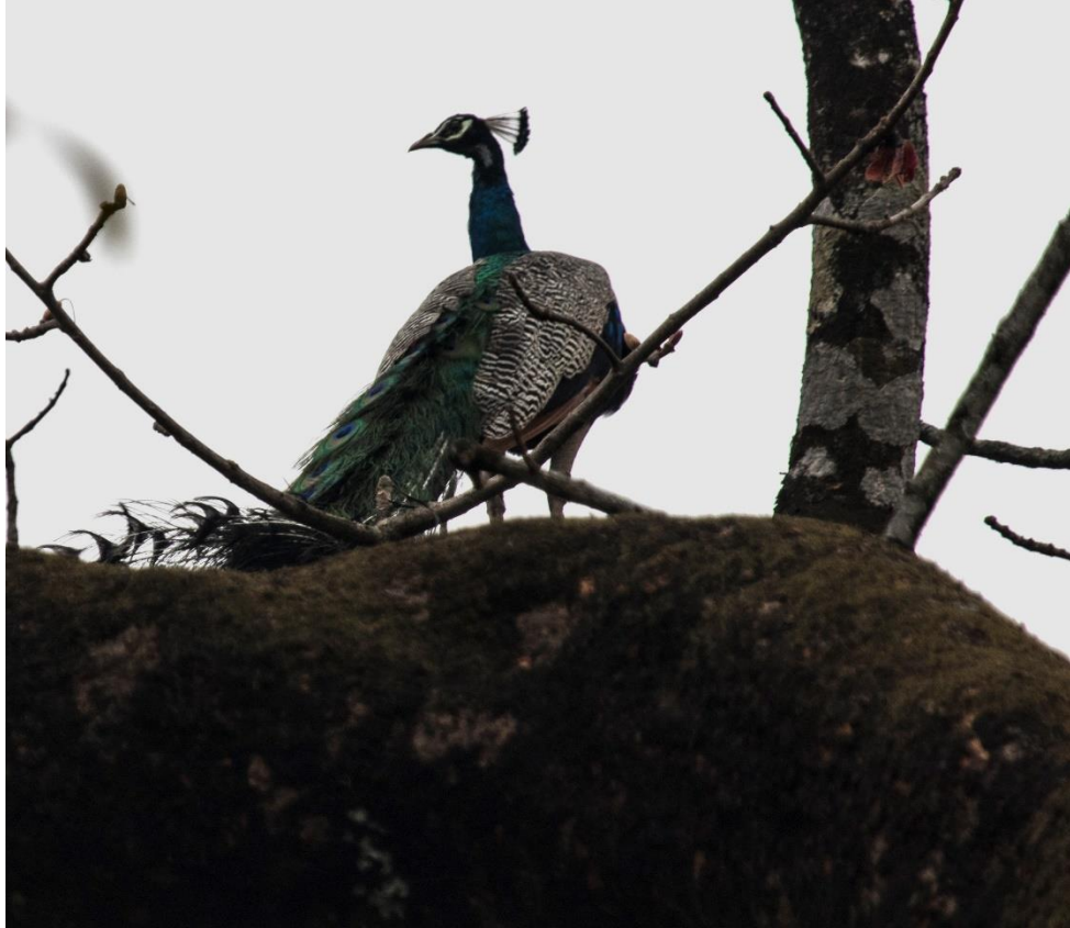
Perched on a tree, a peacock answers to the call of its mate