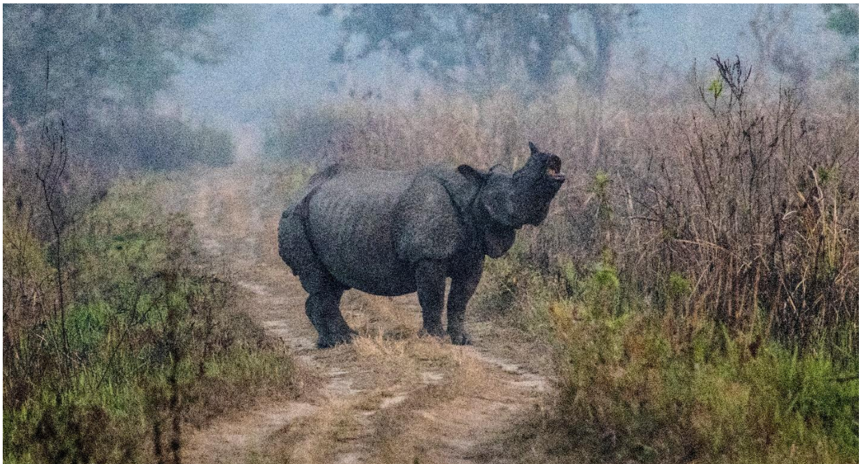
An angry rhino ready to strike

The forests are fierce but there is mercy in every place. Creatures of nature have the power to move us immensely and lift our souls to give us a brief glimpse of the joy we had abandoned when we separated ourselves from Nature. Maybe the soul is not entirely dead, somewhere it still lives and retains its pristine purity. Maybe it will survive our greed, our networked mind and our technology driven being.