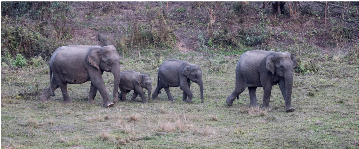
An elephant family returning to the forest after all the toils of the day

The wayfarer has but a brief sojourn in every station of life but is never allowed to rest. It is his curse and his blessing to keep on travelling. Nights of longing turn into the despair of the day. He passes by the lakes of his childhood whose waters reflect his lost innocence. The fierce winds around blow his voice and hopes away. The harsh sun burns his skin. The travails of the journey toughens him and drains his soul. He travels through the fog of life trying to come to terms with his fragility and mortality. Sometimes, for a brief fleeting moment, the haze lifts and he sees the glorious sight of a magnificent city that beckons him irresistibly. But no sooner he is able gather his strength to run towards it than it disappears again into the mist. He will never reach it. He is made and unmade by the forces of wind, water, sun and the earth. At the end, he is humbled by the realization that there is nothing beyond yearning and it is this yearning that breaks upon the shores of his mind convincing him that the vast ocean of life is made only of the surfs of yearning.