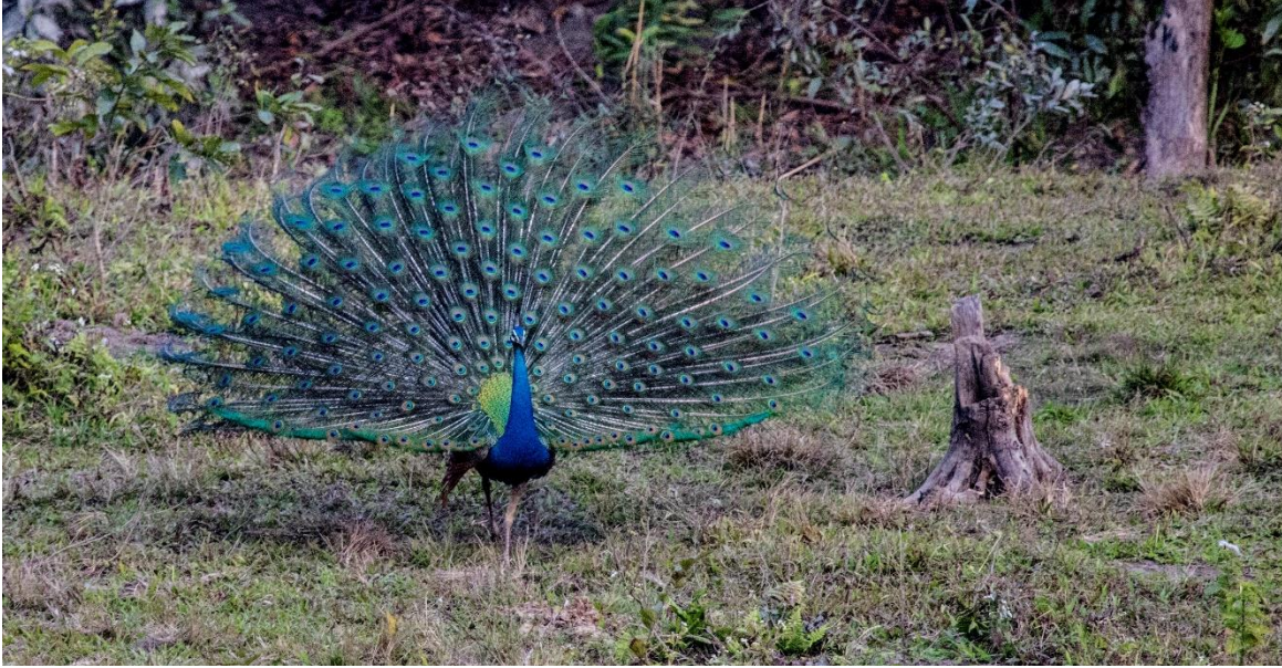
And he starts dancing in joy

The wayfarer has but a brief sojourn in every station of life but is never allowed to rest. It is his curse and his blessing to keep on travelling. Nights of longing turn into the despair of the day. He passes by the lakes of his childhood whose waters reflect his lost innocence. The fierce winds around blow his voice and hopes away. The harsh sun burns his skin. The travails of the journey toughens him and drains his soul. He travels through the fog of life trying to come to terms with his fragility and mortality. Sometimes, for a brief fleeting moment, the haze lifts and he sees the glorious sight of a magnificent city that beckons him irresistibly. But no sooner he is able gather his strength to run towards it than it disappears again into the mist. He will never reach it. He is made and unmade by the forces of wind, water, sun and the earth. At the end, he is humbled by the realization that there is nothing beyond yearning and it is this yearning that breaks upon the shores of his mind convincing him that the vast ocean of life is made only of the surfs of yearning.